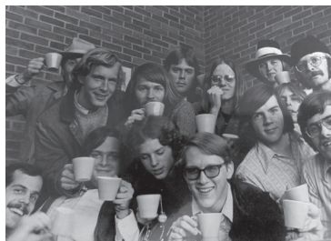
Saturday Morning Breakfast Club circa 1975