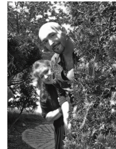
Vocal Duo, MeCa will perform at Alumni Day, May 7th.