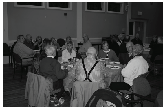
Friday evening Pizza Party